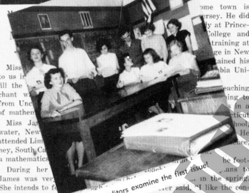
The editors examine the first issue of the Smoke Signal.

We of the Smoke Signal wish her luck in all she plans to do and hope that she will enjoy working here for many years to come.